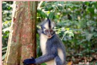
Thomas Leaf Monkey ( Presbytis thomasi )