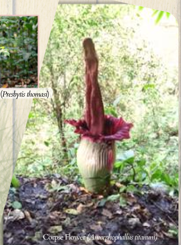
Corpse Flower ( Amorphophallus titanum )