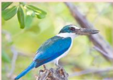
Collared Kingfisher ( Todiramphus chloris )