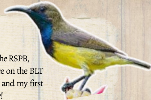
Ornate Sunbird ( Cinnyris ornatus )

I am very happy with all the wonderful wildlife I have already seen, but by the end of my time here I hope to see some of the large birds of prey that soar over the mountains and one of the Hornbills that live in the jungle.